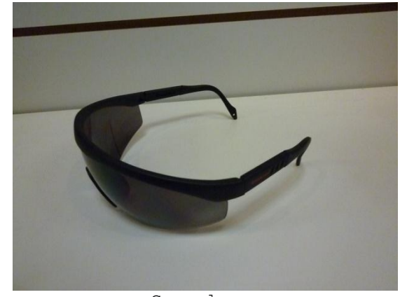
Clear lens Gray lens